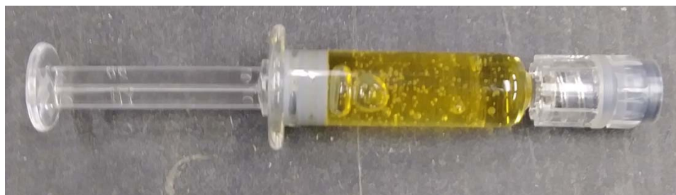
Figure 1: Cannabis extract thickener provided in a glass syringe.